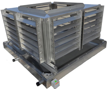
Supply Air Diffuser

EVAPCO LD diffusers come in three different styles: