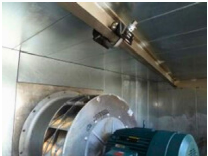
Motor Removal System