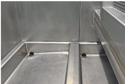
Fully Welded Drain Pan

The unit incorporates fully welded and pitched stainless steel drain pan systems. The welds are smooth and non-porous. The drain connections are fully recessed to facilitate complete drainage in all sections.