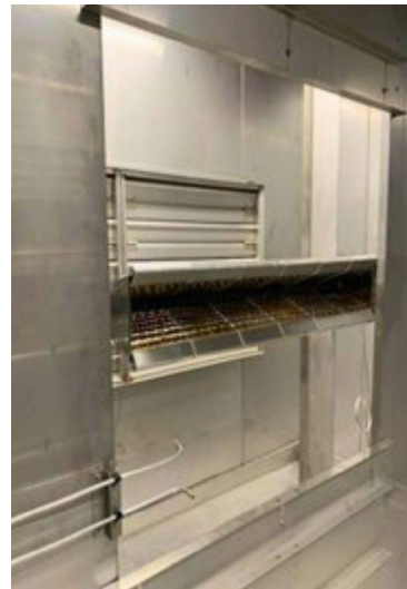
Direct Fired Burner

EVAPCO's Integral exhaust section is designed for optimal performance and maintenance. This section can be used for cleanup cycle, exhaust, and pressurization controls.