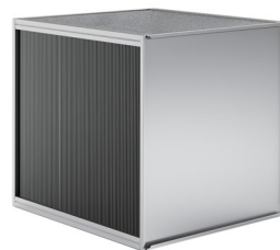
Air to Air Heat Exchanger