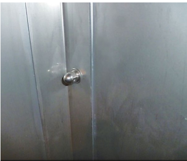
No Exposed Threads

The casing walls of the Ultra CPA are manufactured with heavy gauge double wall construction for long equipment life. Casing walls are foamed in place with close-cell insulation resulting in a single piece, unitary construction with no through metal design.