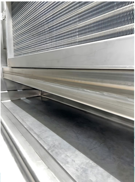
Ultra-CPA System – Cleaning Under the Coil is Easy and Efficient

The uniquely designed coil support system makes cleaning under the coil both easy and efficient. There are no longer “open” structural steel supports under the coil which obstruct the cleaning and inspection process. The new “closed” coil support system eliminates “hidden” areas, while providing full visibility and access to the coil supports and surrounding areas for maximum cleaning efficiency.