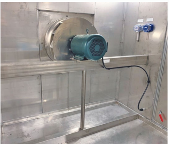
Direct Drive Blower

Direct drive aluminum blowers are use in lieu of belt driven blower. This blower design eliminates belts and the associated cleaning, maintenance and dust issues. The use of Variable Frequency Drives results in efficient fan operation, precision balancing of the system and maximum energy savings. In addition, the “closed” structural support system completely eliminates the traditional support and framing around and under the blower, making cleaning and inspection simple and efficient.