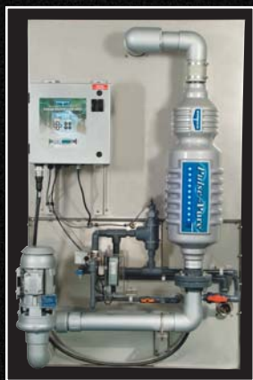
Non-Chemical Water Treatment