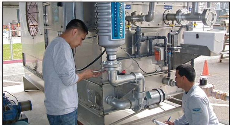
Pulse~Pure ® Installation on Equipment at the EVAPCO WEST Plant

SINGLE SOURCE PROVIDER – The EVAPCO WEST Mr. GoodTower® Service Center provides FREE UNIT INSPECTIONS, technical advice, EvapLiner coating, non-chemical water treatment, rebuilds & repairs and parts for all equipment manufacturers. Contact us for all your evaporative cooling needs.