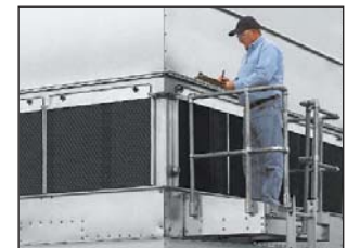
Platform and Ladder