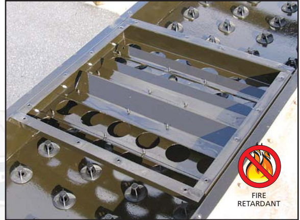
Hot Water Basin Coated with EvapLiner

EQUIPMENT UPGRADES – Super low sound fans, platforms and ladders, electric water level control and other upgrades are readily available.