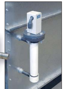
Electronic Water Level Control

BEST LEAD TIMES IN THE INDUSTRY! COMPETITIVE PRICING! MATCH EXISTING PARTS! THERMAL PERFORMANCE GUARANTEE!