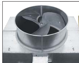
Super Low Sound Fan