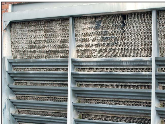
Old, Inefficient, Damaged Fill

MEDIA REPLACEMENT – Scaled, collapsing or damaged fill media can significantly reduce heat transfer and thermal performance. Missing or defective drift eliminators contribute to excessive drift resulting in water and chemical loss, higher operating costs and damage to surrounding buildings and vehicles. Scaled inlet louvers restrict airflow and reduce thermal performance.