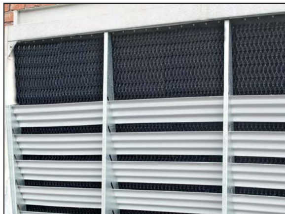
EVAPCO Mr. GoodTower® High Efficiency Fill