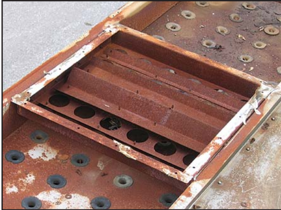
Corroded Hot Water Basin

EVAPLINER COATING – EvapLiner is a cost effective means of extending equipment life for several years. EvapLiner will restore corroded surfaces and seal leaks. It is fire retardant, includes a mechanical and chemical bond, requires limited downtime (usually 6 hours after application) and is a flexible membrane so it will not chip, crack or peel.