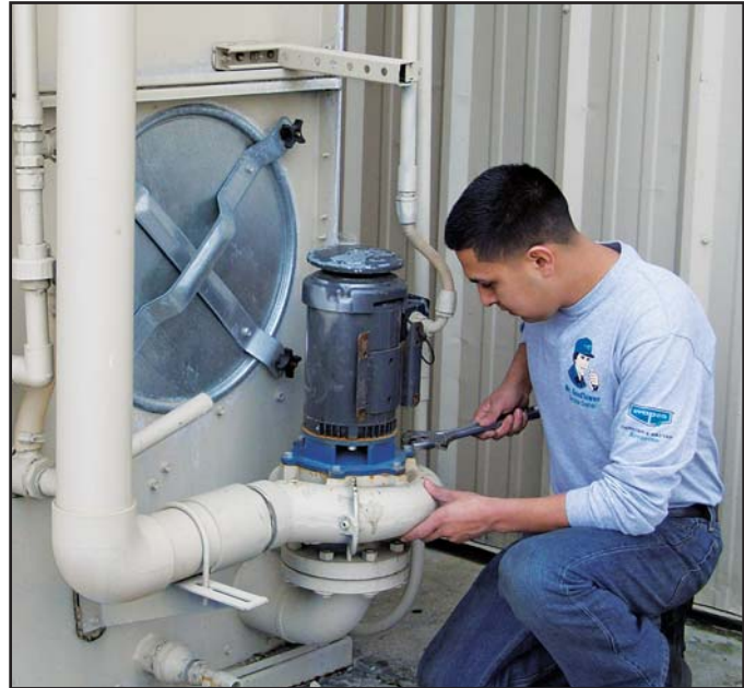
Factory Trained and Certified Service Mechanic

The EVAPCO WEST Mr. GoodTower® Service Center is dedicated to the satisfaction of all our customers. For over 30 years EVAPCO WEST has built quality units with a commitment to excellence. This same philosophy is a core value of our service work.