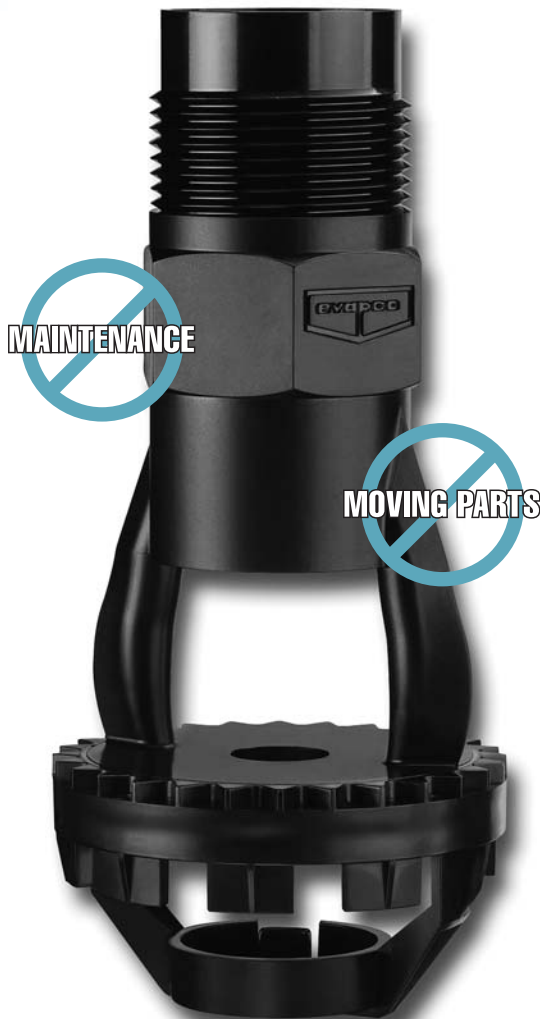
ZMII ® Spray Nozzle

EVAPCO is proud to introduce the NEW ZMII ® Spray Nozzle —the latest advancement in Zero Maintenance nozzle technology. The ZMII ® Spray Nozzle has been updated with a more robust design for greater durability and a new configuration for enhanced water droplet formation. The unique design features of the ZMII ® Spray Nozzle eliminate the need to repair or replace spray nozzles.