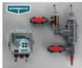
Mounting Plate Shown is Optional

Conductivity is maintained with a temperature-compensated toroidal sensor and a motorized ball valve. In addition, The ECC includes a timer-operated 115/230 volt output relay.