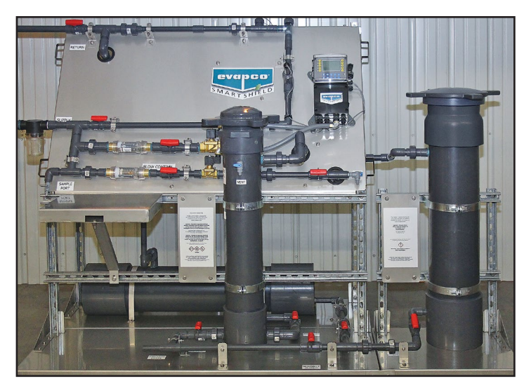
Monitored Release System (MRF-1 shown)