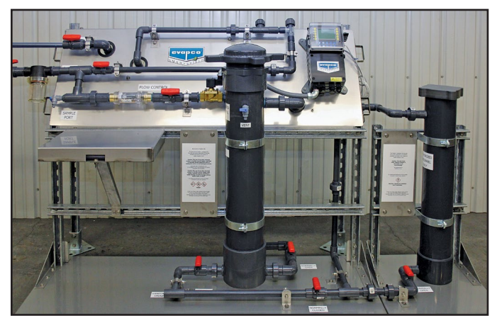
Controlled Release System (CRF-1 shown)

Contact your local EVAPCO Representative to learn whether the Controlled Release or Monitored Release System is right for your open evaporative cooling application.