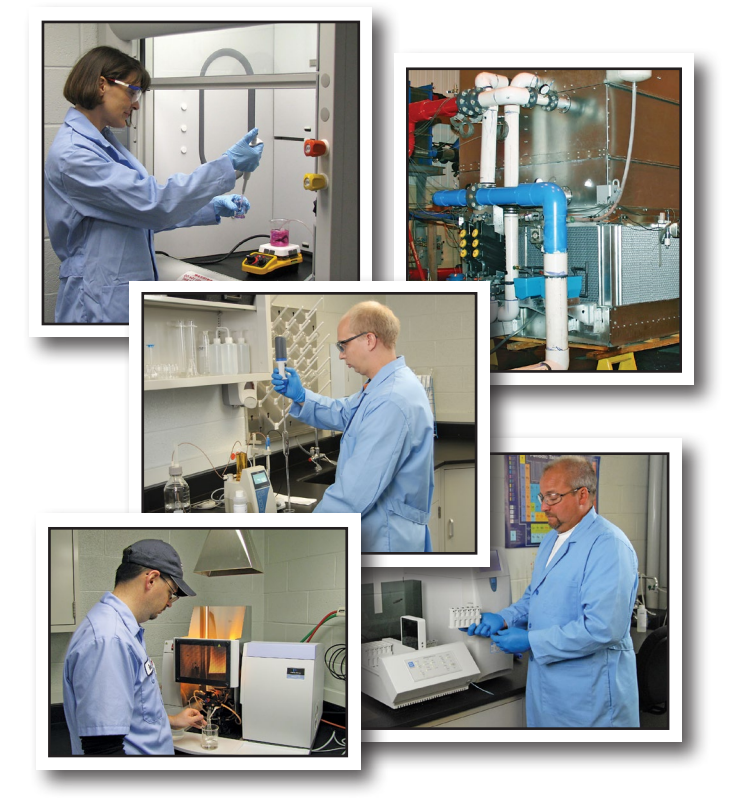
EVAPCO's Water Analytical Services

EVAPCO's Water Systems division focuses on the application and ongoing development of water treatment systems as well as research on passivation and corrosion. This division utilizes advanced technologies and equipment in the field of analytical chemistry, including Ion Chromatography and Atomic Absorption Spectroscopy, giving EVAPCO the ability to conduct fast and accurate analyses of chemical, non-chemical, and hybrid water treatment systems.