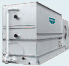
Closed Circuit Cooler