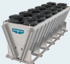
Closed Circuit Cooler