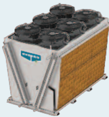
Closed Circuit Cooler