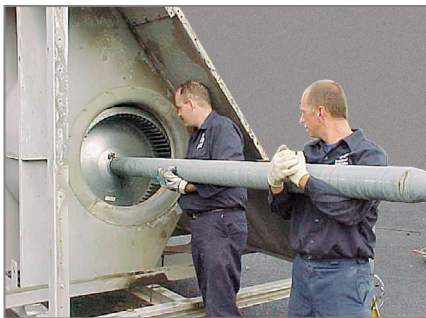
Fans and Shaft Kits