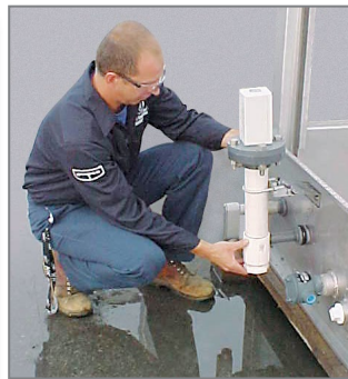
Electrical Water Level Controls