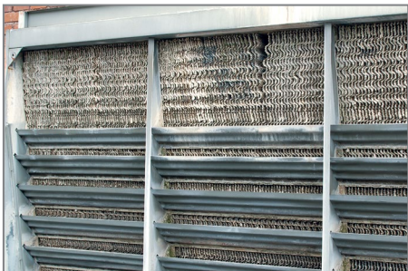
Old, Inefficient, Damaged Fill