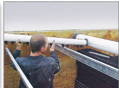
Water Distribution Systems and Counterflow Fill

Mr. GoodTower Service Centers will evaluate existing equipment layouts and recommend replacement units.