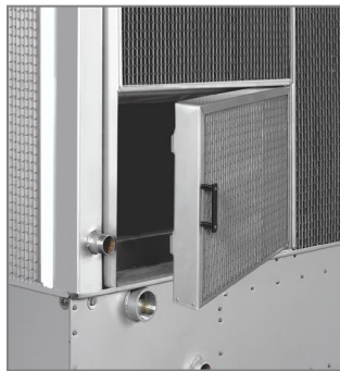
Louver Access Door