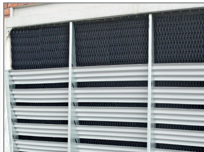
Mr. GoodTower High Efficiency Fill