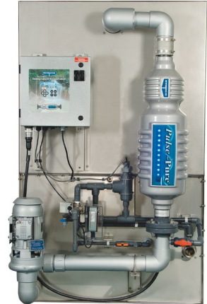
Pulse~Pure Non-Chemical Water Treatment System