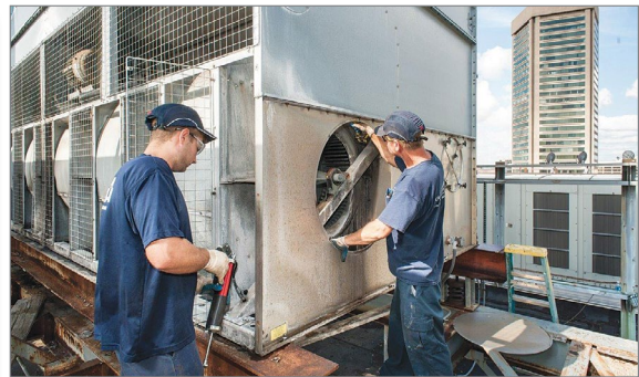
Shaft Inspection and Bearing Lubrication

Mr. GoodTower Service Centers stock parts for emergency repairs!